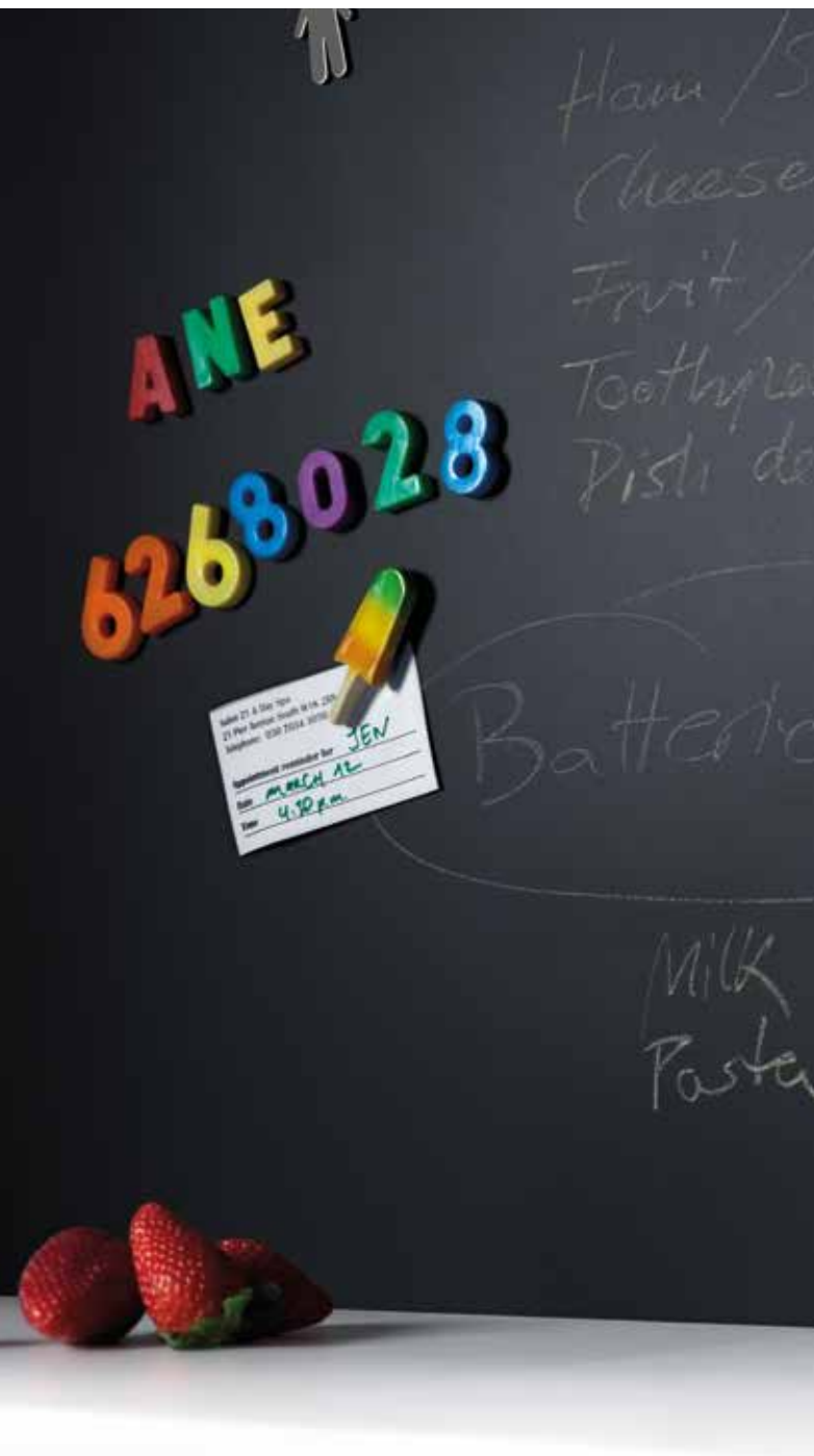
Formica® Matt Black