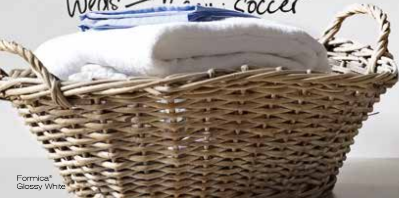
Formica® Glossy White