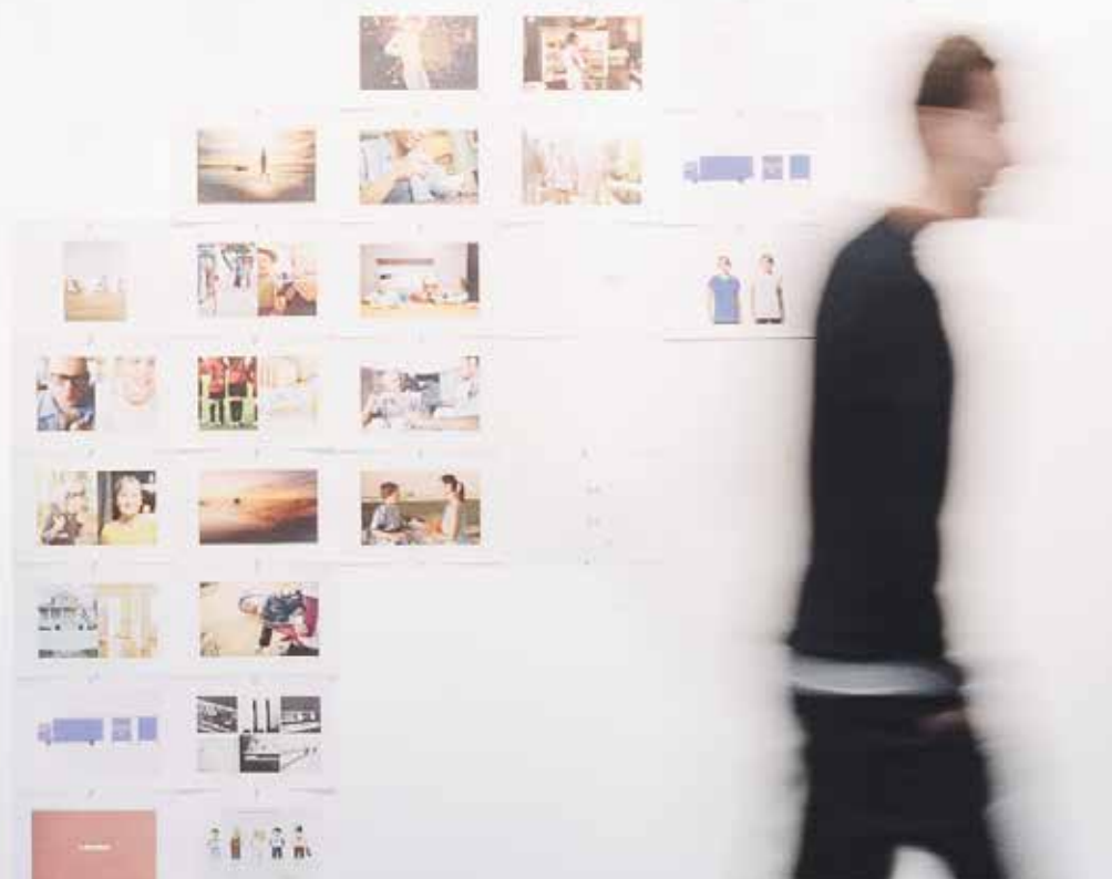
Fisher & Paykel Office designed by Custance