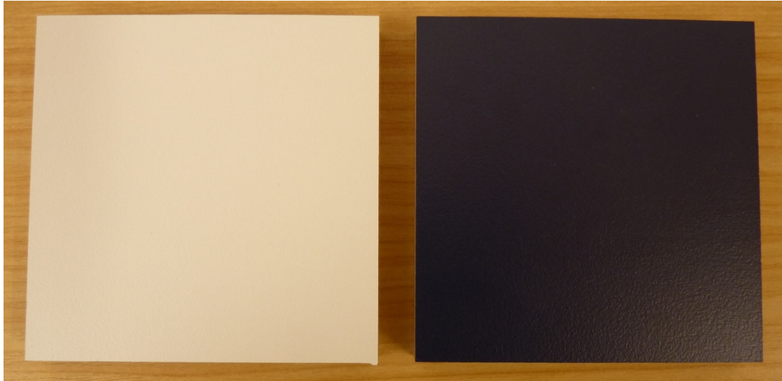
Figure 1: Representative specimens (Gentle Beige on left, Blue Moon on right)

The products submitted by the client for testing were identified as Melteca on Lakepine Fire Retardant MDF Substrate. Figure 1 illustrates a representative specimens of that tested.